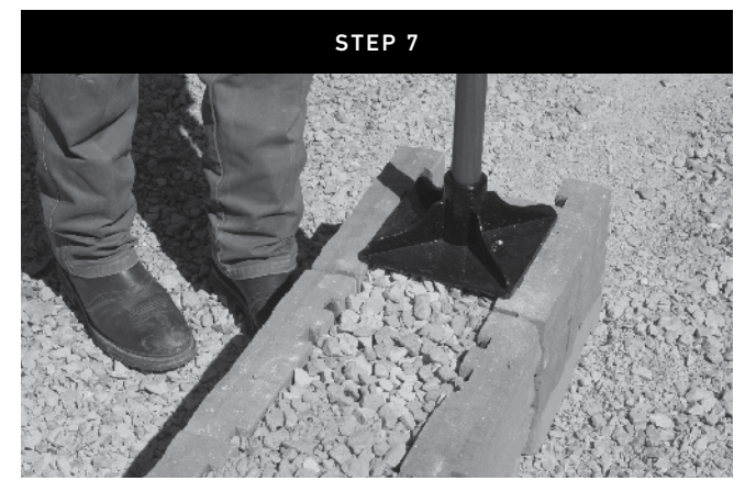
Lightly hand compact the gravel in between the panels for proper compaction.