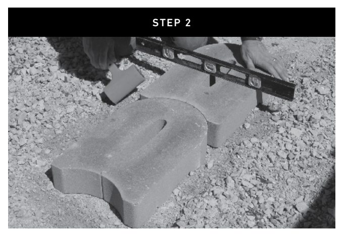
Place the Base Block (shown here) on the compacted gravel. Level the base block units front to back as well as side to side. Making sure the units are fully level.

Remove all surface vegetation and debris. Select the length of the wall and excavate a trench the length of the wall and approximately 12" from top of final grade. Then place a minimum of 6" of dense graded aggregate and compact to 95% standard density or modified. It's not recommended to use a pea rock or a rounded type of material on the base.