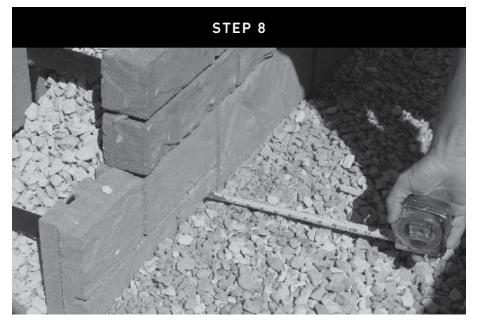
Place 12" of 3/4" drainage rock behind the rear panel of the wall. This will provide for proper drainage behind retaining walls.