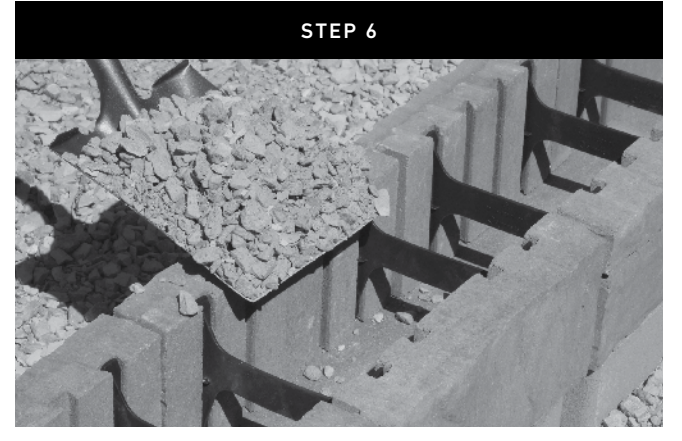
Place 3/4" crushed rock in between the panels to provide frictional connection and proper internal drainage.