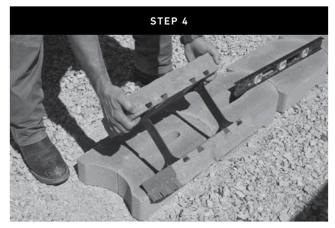
Place the assembled Tandem Wall unit on the top of the U Start Base Block or Torpedo Base Block, making sure that the first course is centered on the base block. Check to make sure units are kept level.