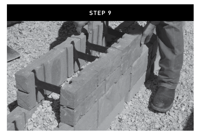
Set additional courses of the Tandem Wall. Making sure that you are keeping the wall in proper alignment. Backfill and compact each additional course.