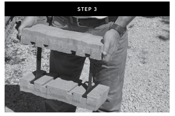
Assemble the Tandem Wall units by inserting the Tandem Wall connectors into the dove tails. Make sure the front and rear panels are the same length.